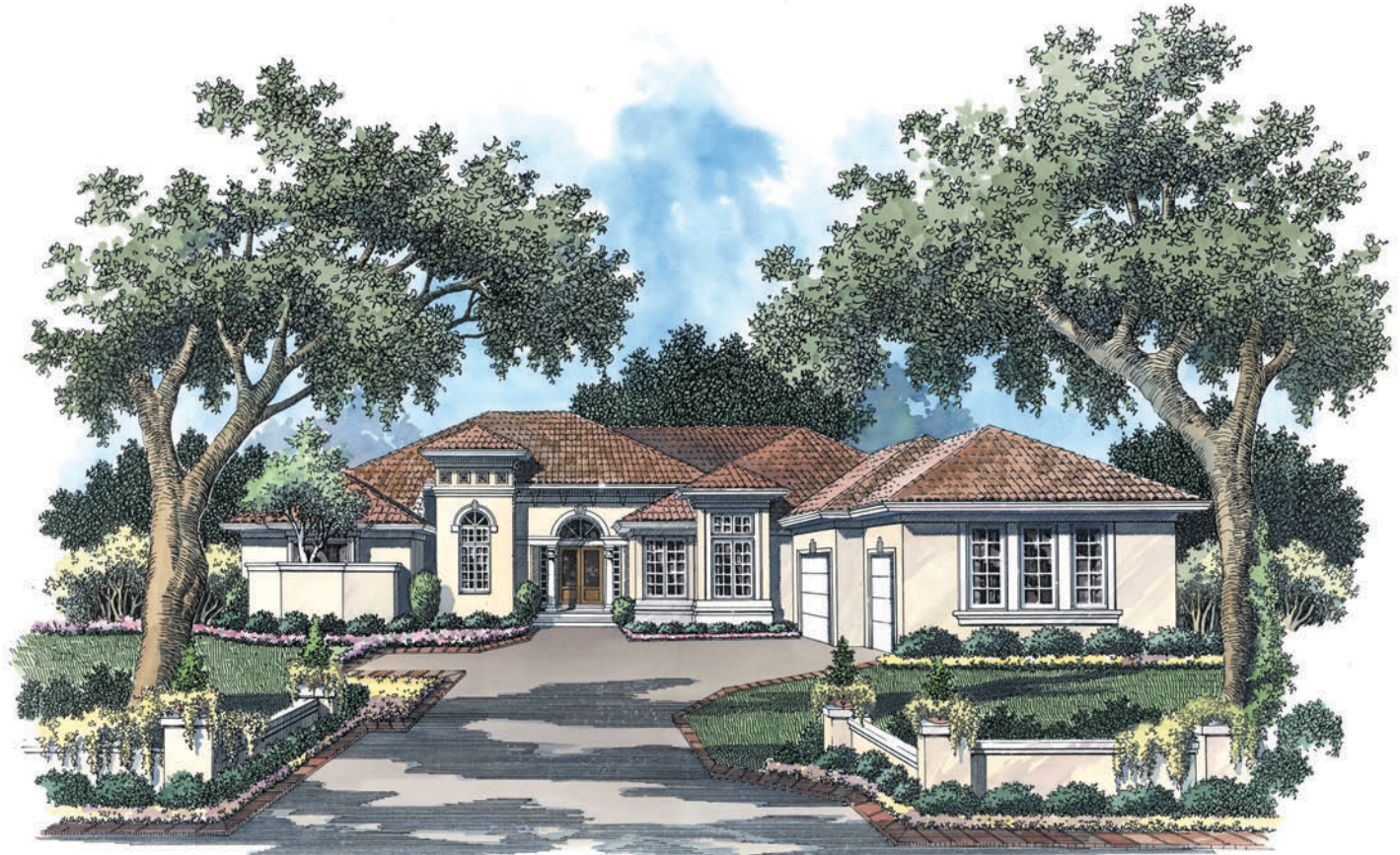
© The Sater Design Collection, Inc.