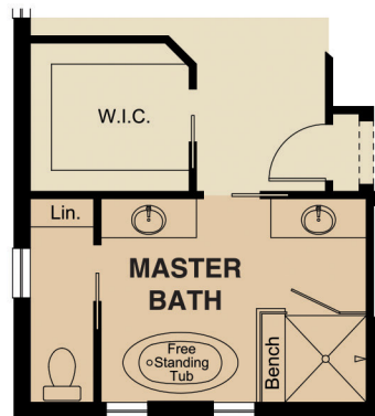
OPTIONAL MASTER BATH LAYOUT 2